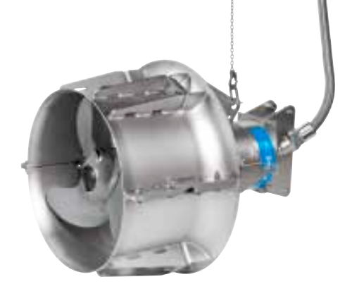
Extended jet ring