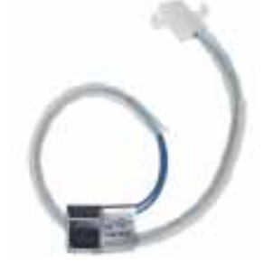
Stator leakage sensor

Provides extra corrosion-resistance for seawater applications.