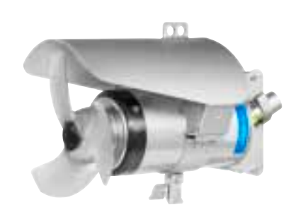
Vortex protection shield