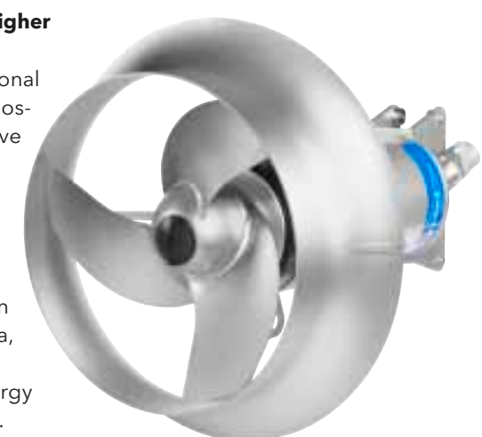
Optional jet ring for increased mixing efficiency.

With the optional jet ring, it is possible to achieve an increase in mixer efficiency by up to 15% in water - and even higher in viscous media, while further reducing energy consumption.