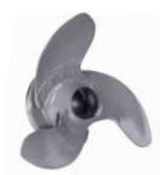
Cast iron propeller