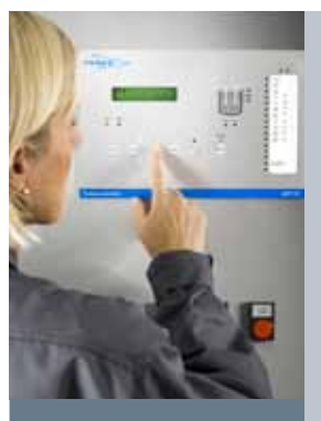
Extensive monitoring and control

We supply hardware and software for complete process systems - from individual pump drives, starters, sensors and controllers to system software and scalable SCADA systems.