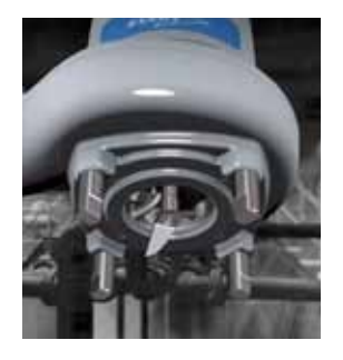
The Flygt cutting knife effortlessly chops food and fish matter, including whole fish, into small, easy-to-pump solids. Available for 3127 and 3153.