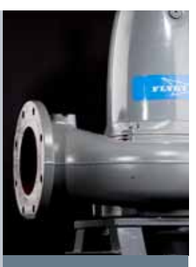
Broad range capacity