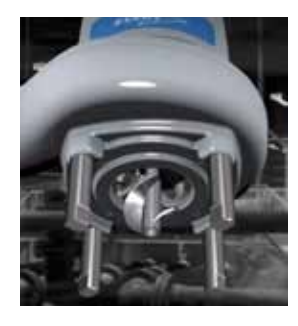
The Flygt feeding screw handles material with a high dry-solid content with ease. Available for 3153.