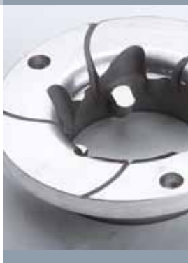
The F-pump advantage