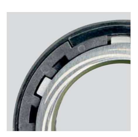
The Active Seal™ system, a patented zeroleakage double-seal system, actively prevents liquid from entering the motor cavity, thereby reducing the risk for bearing and stator failure.